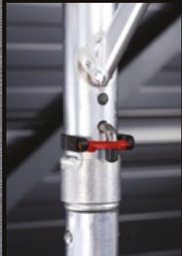
Integrated frame clip option