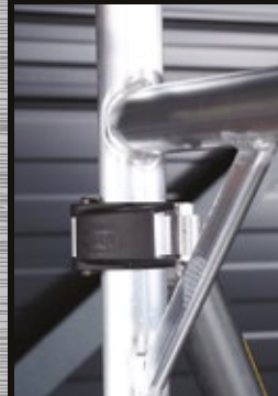
Easylock couplers option on stabilisers