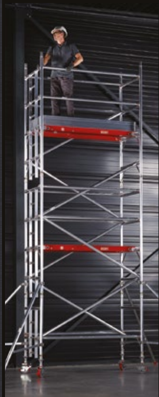
Single width 3T