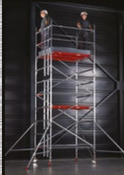
Double width 3T