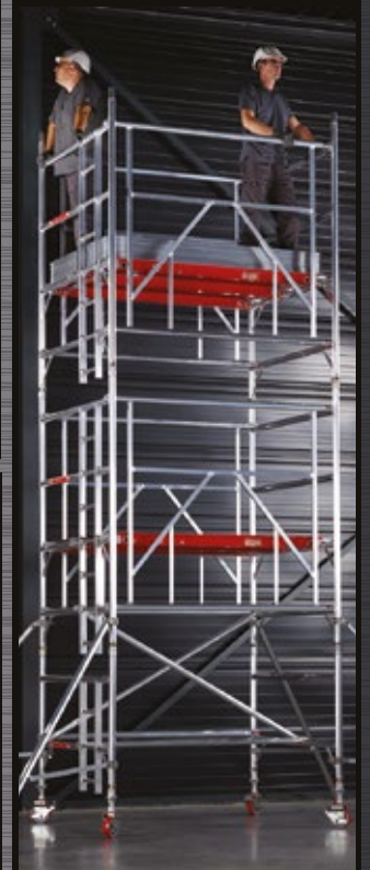
Double width AGR