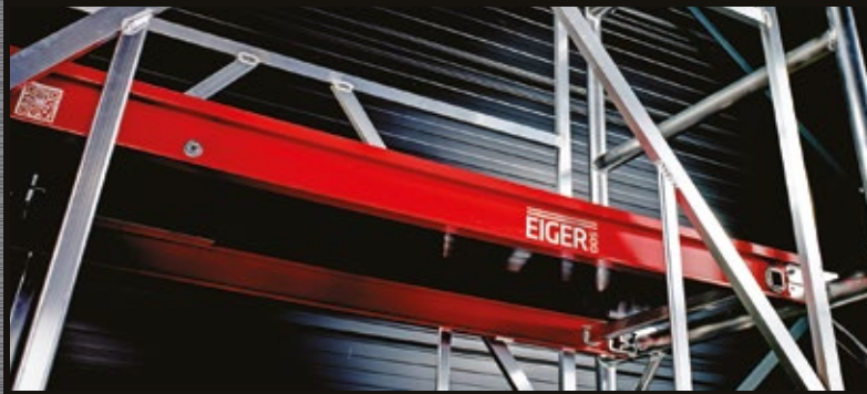
QR, colour and branding options for platform